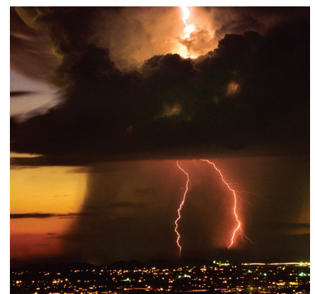
Vaisala TSS928™ accurately reports the range and direction of cloud-to-ground lightning and provides cloud lightning counts.

TSS928 can be used to integrate lightning reports with automated weather observation programs such as METAR.