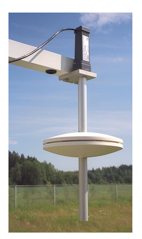
SPH10/20 is easy to install and connect. In the picture, SPH10 is connected to PTB210.

SPH10/20 Static Pressure Heads minimize the effects of wind on barometric pressure readings.